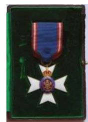
MVO 4th Class