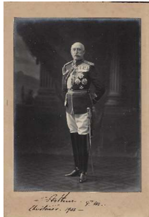
Duke of Connaught 1933 No.3 46/920