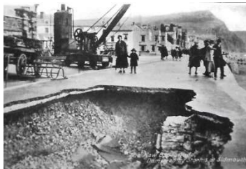
This photograph, obtained from the Sidmouth Museum (Strip No 58/220 Neg), shows our mother Bunty, and her mother Gladys examining the storm damage to Sidmouth’s New Esplanade in 1925.