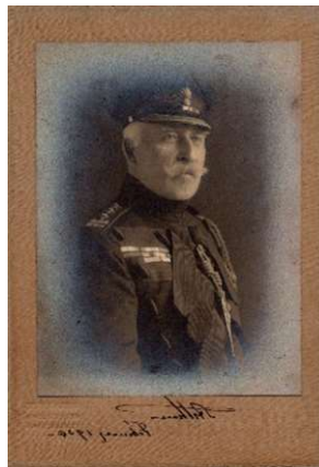
Duke of Connaught 1934